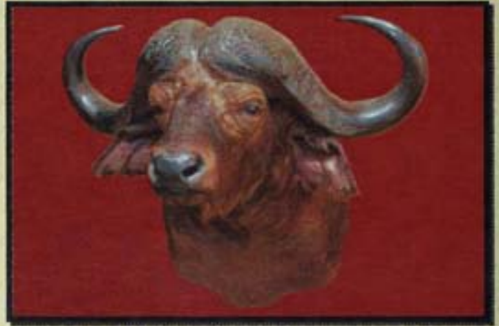
Buffalo shoulder mount