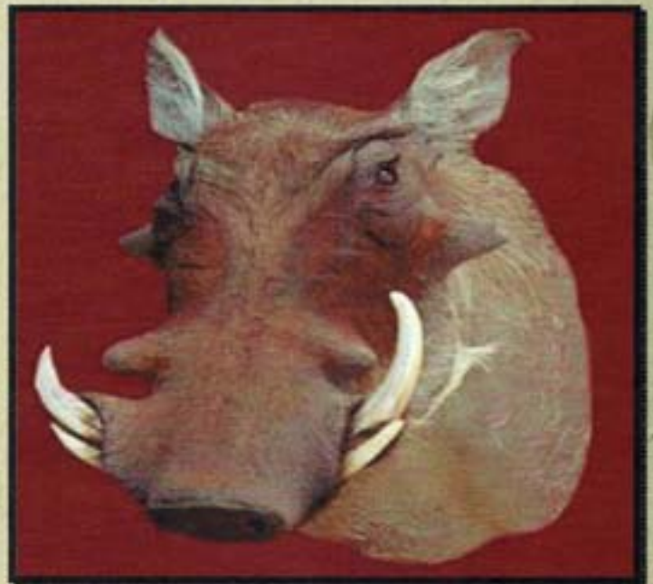
Warthog Shoulder mount