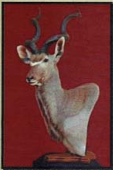
Kudu Floor pedestal mount