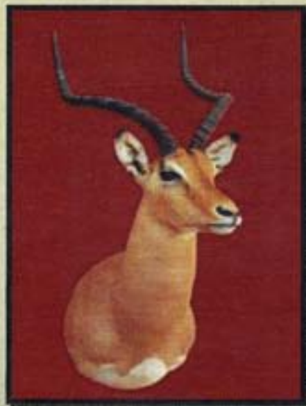
Impala Shoulder Mount