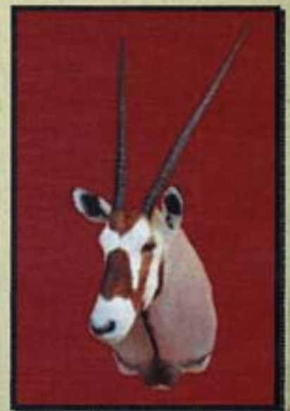
Gemsbuck Shoulder moun