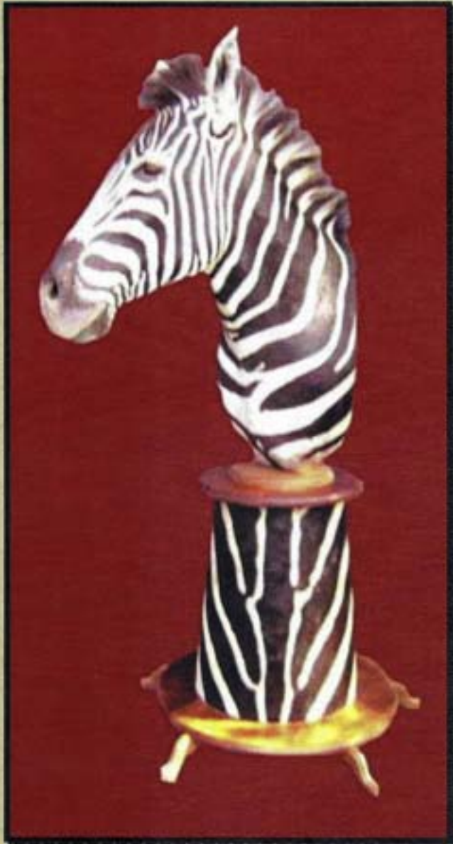
Zebra Floor Pedestal mount